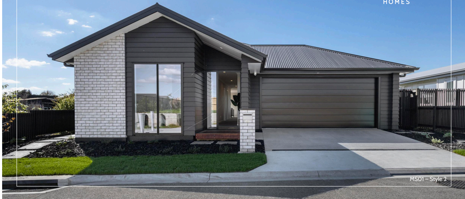
MS01 – Style 2